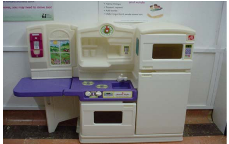
TY 120 - Kitchen Centre