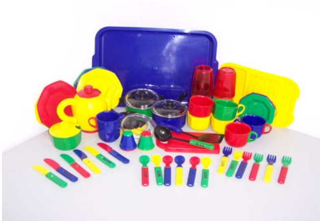
TY 148-Kitchen Play Set 60pc.