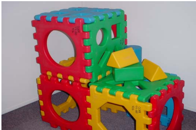
TY 100-Lego Climbing Structure

If you don't have internet access, then stop by and have a look through our Toy Lending catalog. Here are some photos of just a few toys that we have to lend!!