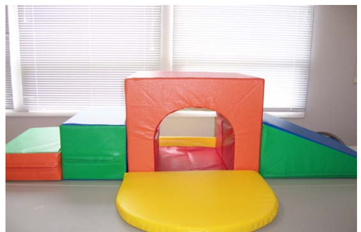
TY191 Tot Tunnel Climber 7pc