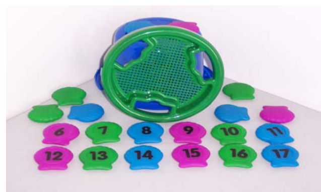
TY 144-Sift & Find Number Shells