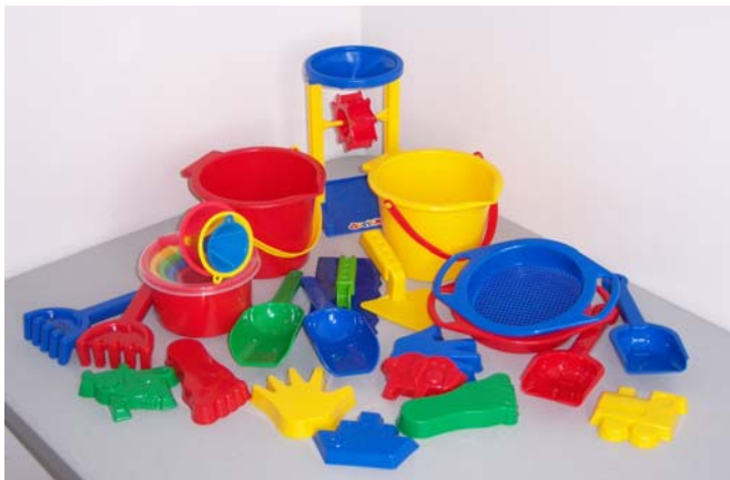
TY 127-Super Sand Pit Kit 29 pc