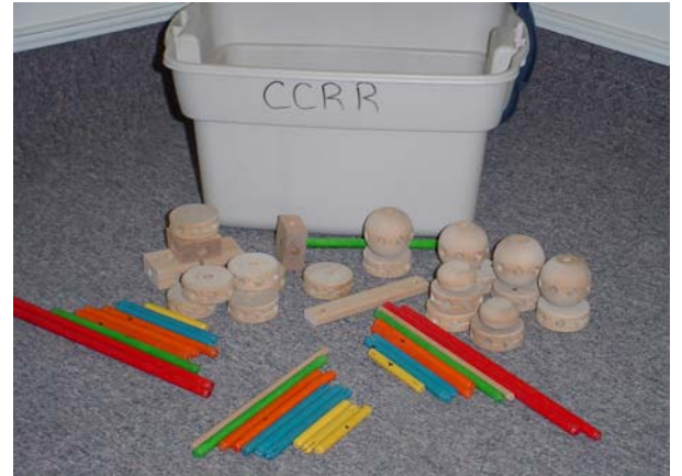
TY 116-Tinker toys 57pc