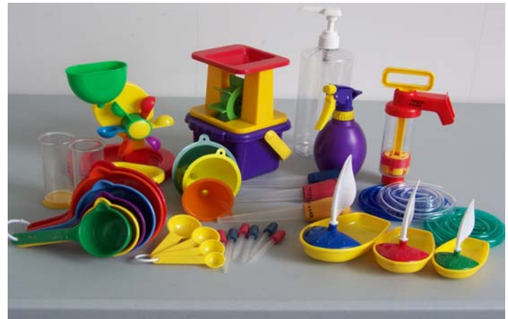
TY 177-Water Play Kit 36pc