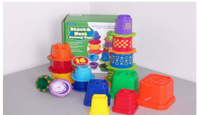
TY 130-Stack and Nest Sensory toys 16pc