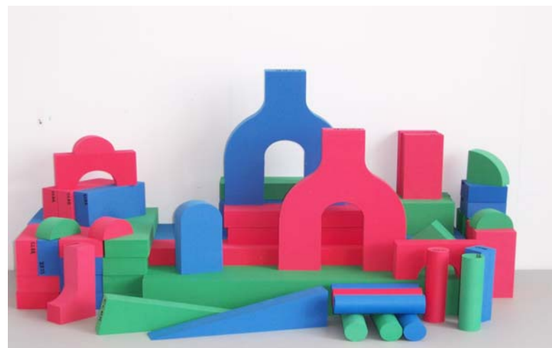
TY 172-Soft Building Blocks 184pc