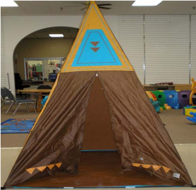
TY238—8' Giant Tee-Pee Tent

Come in and check out our Theme Boxes as well. They are full of fun toys, games and activities.