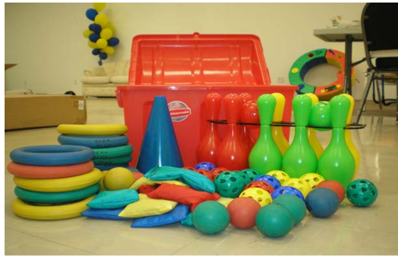
TY219—Activity Treasure Chest