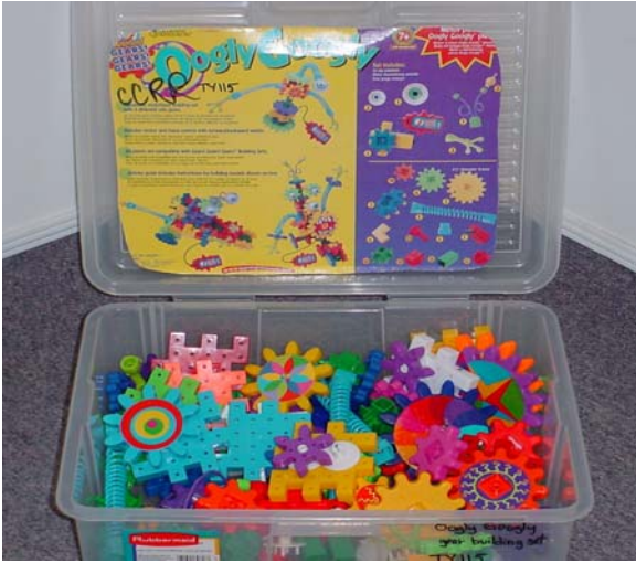
115-Oogly Googly building set 100pc