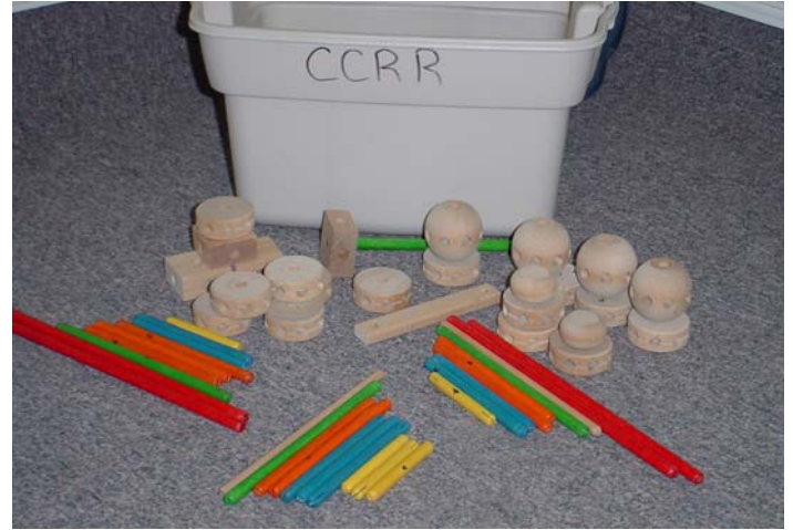
TY 116-Tinker toys 57pc