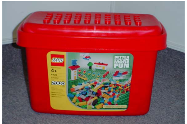
TY 113- Small Lego Building Set