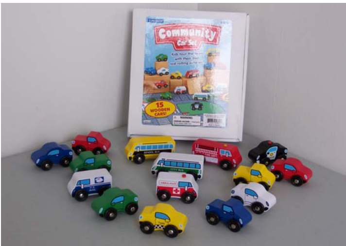
TY180-Community Car Set 15pc.