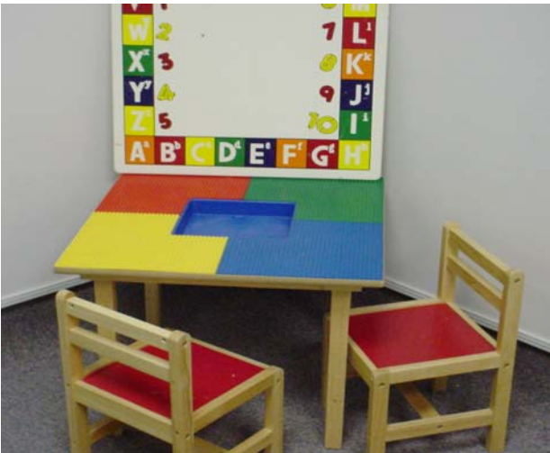
TY 119-Lego table & 2 chairs