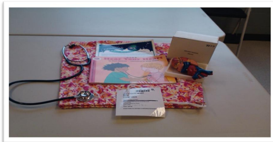
Hear Your Heart Story Sack R029 Barcode: 0427

On Wednesday's you are welcome to visit me at Highland Family Development Centre between 11:00am to 2:00 pm. We house our large toys and equipment there.