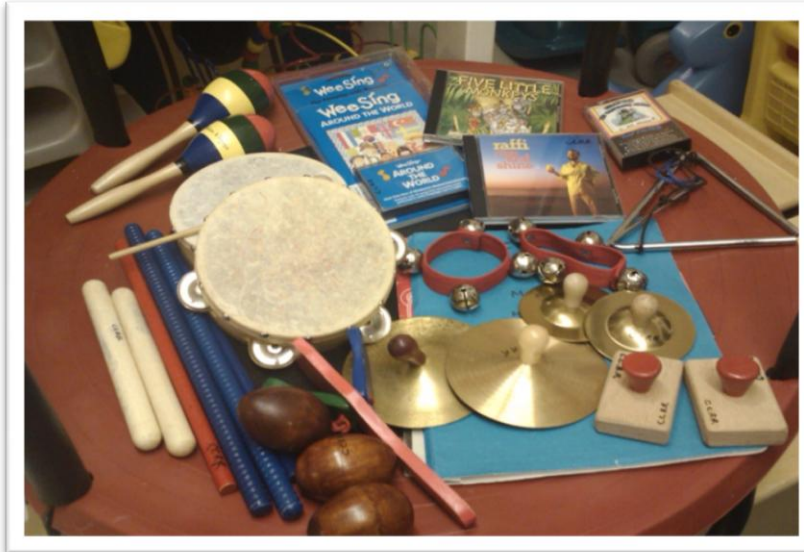
Music Maker TY036 Barcode: 0533